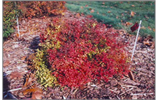
Dakota Goldcharm Spirea in fall

This shrub should only be grown in full sunlight. It prefers to grow in average to moist conditions, and shouldn't be allowed to dry out. It is not particular as to soil type or pH. It is highly tolerant of urban pollution and will even thrive in inner city environments. This is a selected variety of a species not originally from North America.