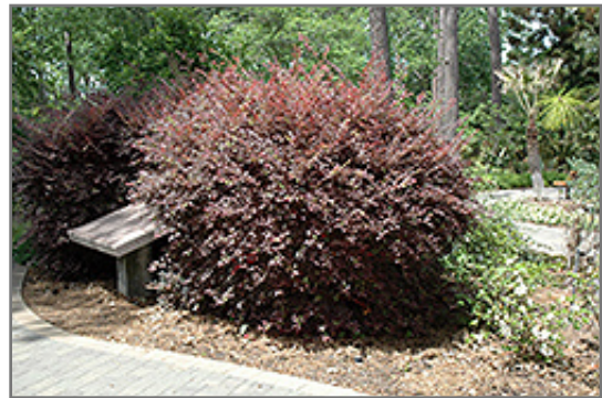
Daruma Chinese Fringeflower