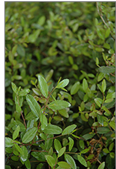
Schilling's Dwarf Yaupon Holly foliage