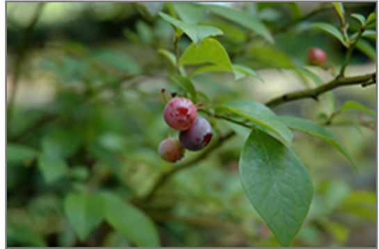
Onslow Rabbiteye Blueberry fruit

This is a multi-stemmed deciduous shrub with an upright spreading habit of growth. Its average texture blends into the landscape, but can be balanced by one or two finer or coarser trees or shrubs for an effective composition. This is a relatively low maintenance plant, and is best pruned in late winter once the threat of extreme cold has passed. It is a good choice for attracting birds to your yard. It has no significant negative characteristics.