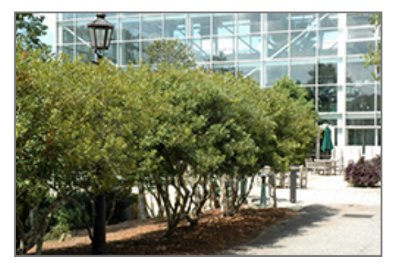
Southern Wax Myrtle

4514 Old Burlington Road Greensboro, NC 27405 p: 1-800-849-4514 w: gsoshrub.com