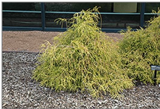
Sungold Falsecypress