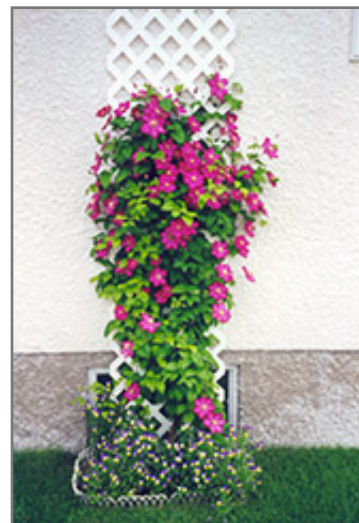
Ville de Lyon Clematis in bloom