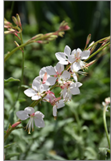
Whirling Butterflies Gaura flowers

This is a relatively low maintenance plant, and is best cleaned up in early spring before it resumes active growth for the season. It is a good choice for attracting butterflies to your yard, but is not particularly attractive to deer who tend to leave it alone in favor of tastier treats. It has no significant negative characteristics.