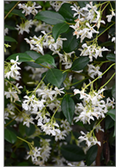
Confederate Star-Jasmine flowers