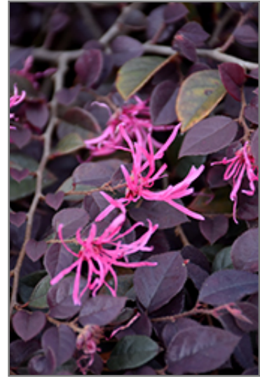
Crimson Fire Chinese Fringeflower flowers

This shrub does best in full sun to partial shade. It prefers to grow in average to moist conditions, and shouldn't be allowed to dry out. It is particular about its soil conditions, with a strong preference for rich, acidic soils. It is somewhat tolerant of urban pollution. Consider applying a thick mulch around the root zone in winter to protect it in exposed locations or colder microclimates. This is a selected variety of a species not originally from North America.