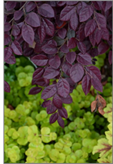
Crimson Fire Chinese Fringeflower foliage

This shrub does best in full sun to partial shade. It prefers to grow in average to moist conditions, and shouldn't be allowed to dry out. It is particular about its soil conditions, with a strong preference for rich, acidic soils. It is somewhat tolerant of urban pollution. Consider applying a thick mulch around the root zone in winter to protect it in exposed locations or colder microclimates. This is a selected variety of a species not originally from North America.