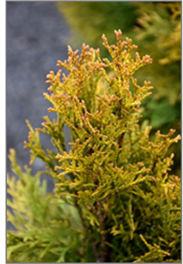
Highlights Arborvitae foliage

This tree does best in full sun to partial shade. It prefers to grow in average to moist conditions, and shouldn't be allowed to dry out. It is not particular as to soil type or pH. It is somewhat tolerant of urban pollution, and will benefit from being planted in a relatively sheltered location. Consider applying a thick mulch around the root zone in winter to protect it in exposed locations or colder microclimates. This is a selection of a native North American species.