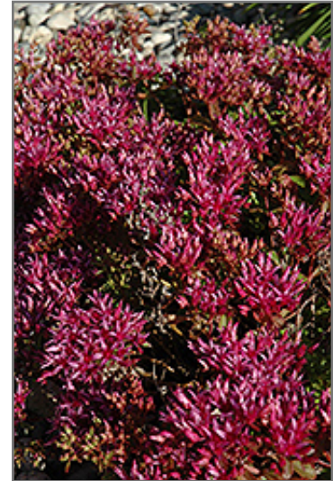
Dragon's Blood Stonecrop in bloom

Dragon's Blood Stonecrop is a fine choice for the garden, but it is also a good selection for planting in outdoor pots and containers. Because of its spreading habit of growth, it is ideally suited for use as a 'spiller' in the 'spiller-thriller-filler' container combination; plant it near the edges where it can spill gracefully over the pot. Note that when growing plants in outdoor containers and baskets, they may require more frequent waterings than they would in the yard or garden.