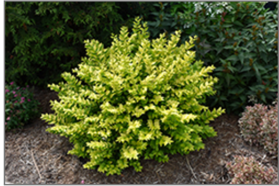
Golden Ticket Privet