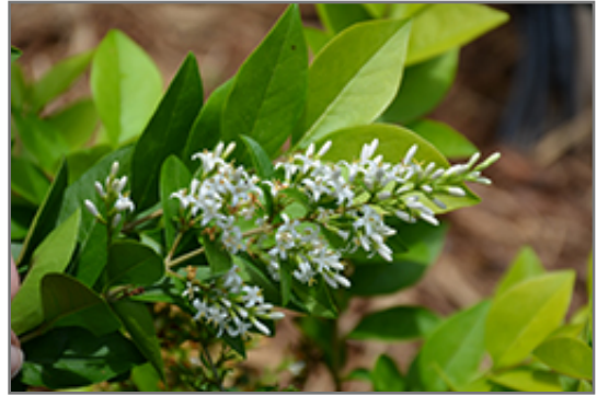
Golden Ticket Privet flowers

This shrub should only be grown in full sunlight. It is very adaptable to both dry and moist locations, and should do just fine under average home landscape conditions. It is not particular as to soil type or pH, and is able to handle environmental salt. It is highly tolerant of urban pollution and will even thrive in inner city environments. This particular variety is an interspecific hybrid.