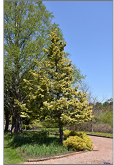
Cripps Gold Falsecypress

This tree does best in full sun to partial shade. It prefers to grow in average to moist conditions, and shouldn't be allowed to dry out. It is not particular as to soil type or pH. It is highly tolerant of urban pollution and will even thrive in inner city environments, and will benefit from being planted in a relatively sheltered location. Consider applying a thick mulch around the root zone in winter to protect it in exposed locations or colder microclimates. This is a selected variety of a species not originally from North America.