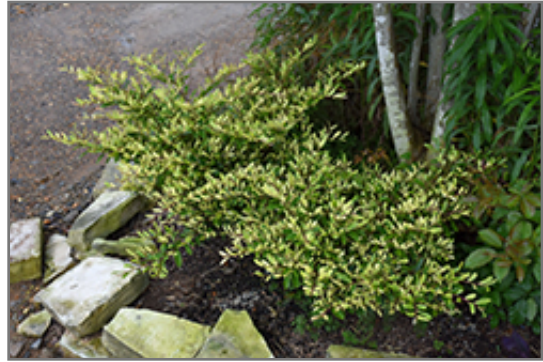
Spring Frost Evergreen Distylium

Spring Frost Evergreen Distylium is recommended for the following landscape applications;