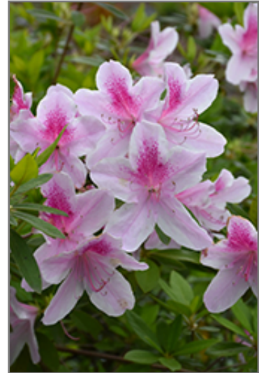
George Lindley Taber Azalea flowers