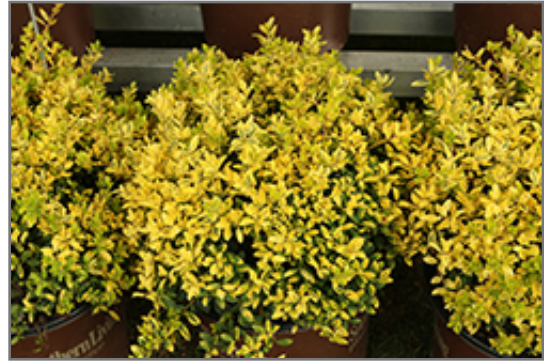
Touch of Gold Japanese Holly

Touch of Gold Japanese Holly is recommended for the following landscape applications;