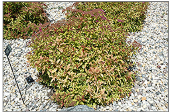
Flaming Mound Spirea