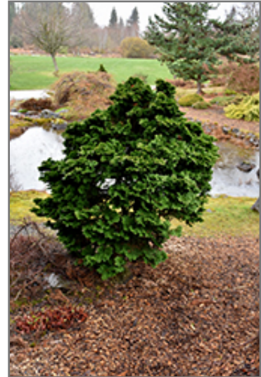
Dwarf Hinoki Falsecypress