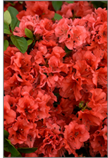
Girard's Hot Shot Azalea flowers