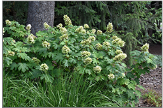
Alice Hydrangea in bloom