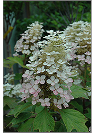
Alice Hydrangea flowers

Alice Hydrangea is recommended for the following landscape applications;