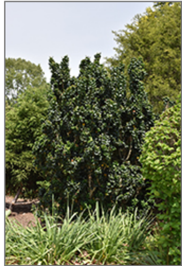
Dwarf Japanese Privet